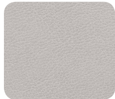
COTTAGE GREY 001