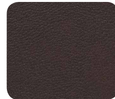
DARK ROAST 006