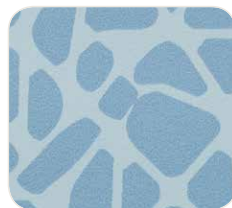
SAN FRANCISCO 004