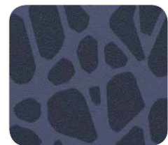
NEW YORK 012