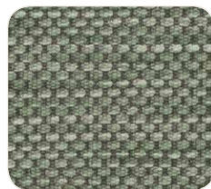
PIECE DYED 013