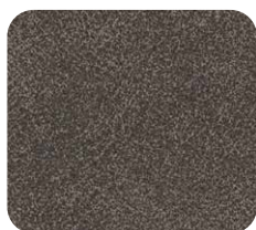
BLACK TEA 007