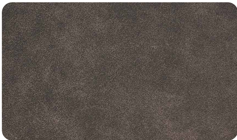
BLACK TEA 007