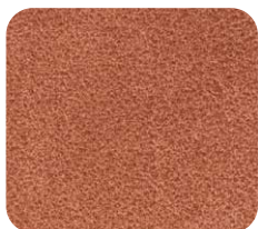
SOFT CLAY 011