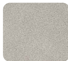
COTTAGE GREY 003