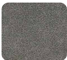
GUN METAL 006