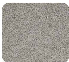
STONE GREY 005