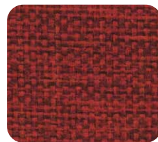
ST LOUIS 018