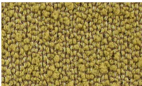
PEA SOUP 010