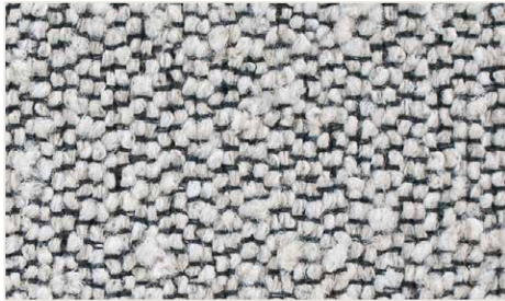
WOOL SOCKS 004