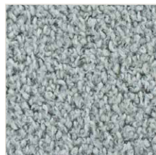
SEA MIST 010