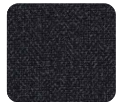
CARBON FIBER 021