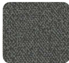
CHAIN MAIL 019