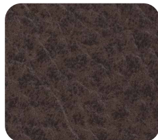
GAME NIGHT 017