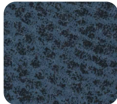
BIG EDDY 009