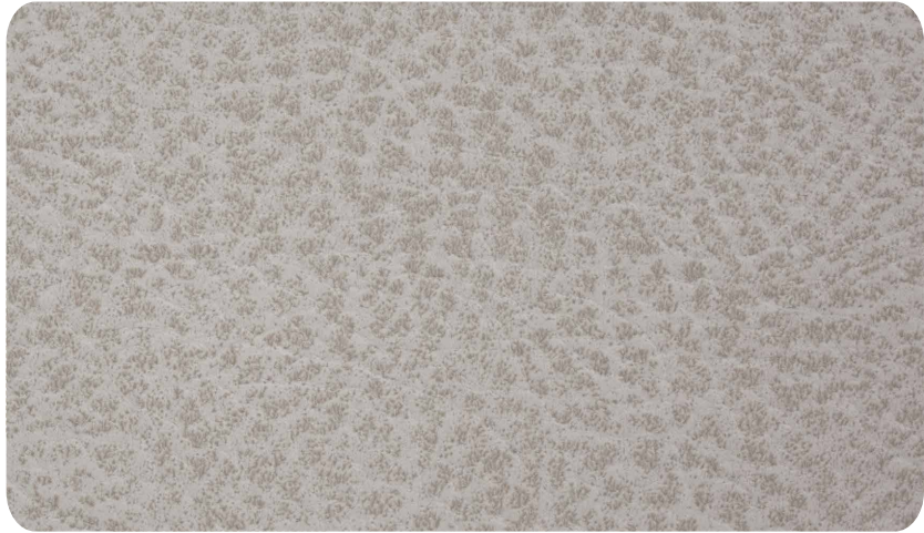
POW POW 003