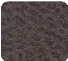
DOSE COFFEE 016