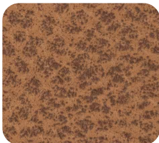
VILLAGE IDIOT 012