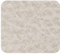
FIRST TRACKS 001