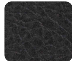
KILL THE BANKER 019