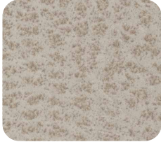
RUN FOR TOM 002