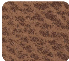
ON TAP 013