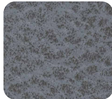
OLD SCHOOL 005