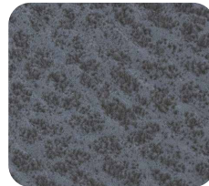
REVEL FOLK 006