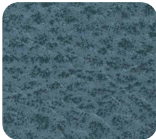
COLUMBIA RIVER 008