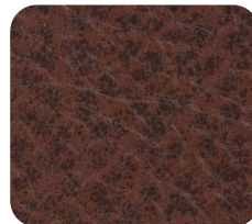
PARTY CABIN 014