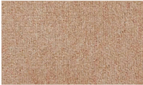
DESERT ROSE 017