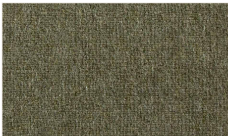
BAY LEAF 019