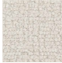
BIRCH BARK 001