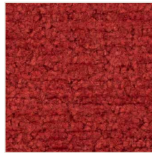
ORDER OF CANADA 011