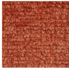
COPPER THUNDER 010