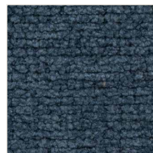
GREAT LAKES 019