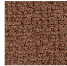
SACRED BEAR 008