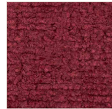
STAINED GLASS 012