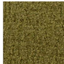
THE LAND 015