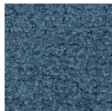
PICASSO OF THE NORTH 018